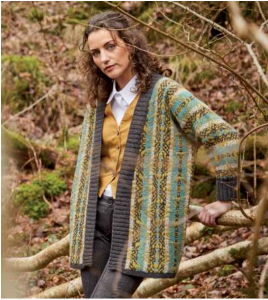
Sample size 71-86 cm (28-34")